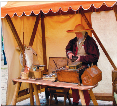
DENMARK Medieval sales at the Middelaldercentret. ■