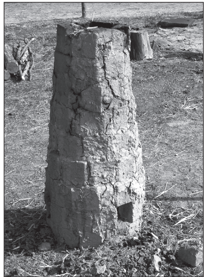
POLAND Building a prehistoric oven, this case: an iron smelting kiln at Biskupin. ■