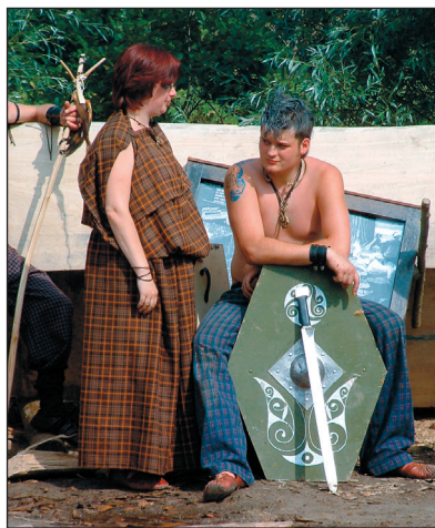
THE NETHERLANDS Romano Celts or Celtic Romans? Historisch OpenluchtMuseum Eindhoven. ■

This cross over between “own interest” (i.e. archaeology) and “local interest” can be a key to success. They organised as well a regional archaeology week, in cooperation with the Perthshire Tourist Board and many other local and regional partners.