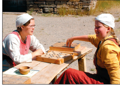
SWEDEN Living history actors playing board games at Eketorp. ■

If you are interested in archaeology, living history or education and want to be informed or entertained, there are numerous activities taking place all over Europe. We try to keep a listing on the EXARC calendar, but this merely gives an impression, not an overview of who is doing what and where in Europe. The brief listing below is based upon that calendar, on which we had 86 activities. As in most cases these activities return every (second) year, for contact addresses and URLs, we therefore refer to the calendar on the EXARC site: www.exarc.net .