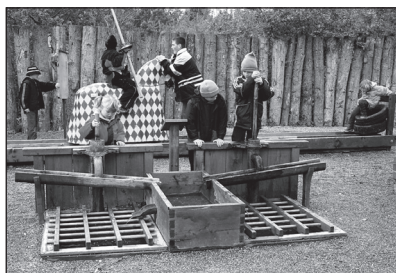
DENMARK Playground with medieval inspired toys, Middelaldercentret. ■

● The Long Museum Night is becoming increasingly popular in “archaeological Europe”. And why not? It offers great chances to give the public an unexpected view on the past. This counts as well for the evening activities at Midsummer or St John, celebrated for example in Aubechies (Belgium), Skäftekärr (Sweden), as the Dew Feast in Kernave (Lithuania) or the Sankt Hans Aften in the Middelaldercentret (Denmark). The last category of evening activities of the year are the Halloween or Samhain nights, for example at the Crannog Centre (Scotland). In many other sites in the “Celtic countries” attention was paid to this theme as well.