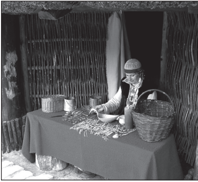
POLAND Sales boot at the Biskupin Festival. ■