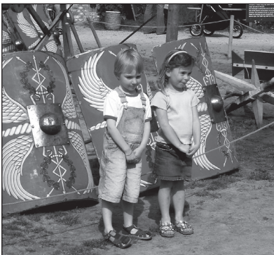
THE NETHERLANDS Children, posing in front of Roman legionary shields, Historisch OpenluchtMuseum Eindhoven. ■