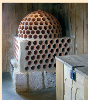
■ Furnace in the tower of the Bachritterburg Kanzach. Picture author.

liveARCH is a European project where 8 EXARC members work together on matters which are important to archaeological open air museums. Together with them, EXARC has formulated a minimum definition of what such a museum actually is. This will be endorsed in March 2009 by the members of EXARC and from that moment on, will be one of the cornerstones of the association. After a minimum definition it would be important to agree on what makes a 'good' museum. Probably in future, EXARC will also try to settle minimum definitions on other important groups and activities, such as for example archaeological education centres, living history or experimental archaeology.