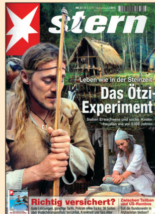
■ "Stone Age" cover of the magazine "Stern" regarding the "Steinzeit, das Experiment".

is 'right' or 'wrong.' Therefore, EXARC has successfully called for a discussion within the international living history scene about what should be allowed and what not.