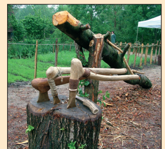
■ Set of "Bronze Age" tools , Archeon, 2008.

Im Jahr 2008 hat EXARC – in Kooperation mit dem liveARCH -Projekt – eine Definition der Mindestanforderungen an ein archäologisches Freilichtmuseum erarbeitet. EXARC hat ebenfalls eine Diskussion innerhalb der internationalen Living History-Szene zur Frage der Darstellung sensibler Themen initiiert. Derzeit gehören zu EXARC 60 Mitglieder in 20 verschiedenen Ländern, die sich alle mit Fragen der Museumsarbeit, der Experimentellen Archäologie und der Pädagogik beschäftigen. Weitere Informationen unter www.exarc.eu .