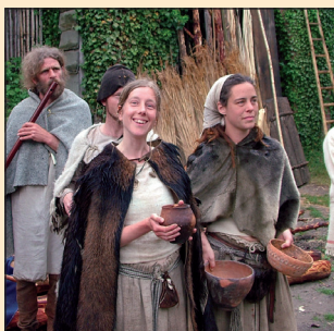
■ Prehistoric ensemble at Archeon, 2008.

EXARC has a reasonably good overview of what is happening when it concerns archaeological open air museums and often serves as 'link pin' between them. In 2008, EXARC sent a flyer to 200 archaeological open air museums across Europe to ask them to consider membership. Most of these museums will be represented in the liveARCH European guide of archaeological open air museums , discussed elsewhere in this volume.