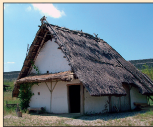
■ House at the Bajuwaren Hof Kirchheim, München.

liveARCH is a European project where 8 EXARC members work together on matters which are important to archaeological open air museums. Together with them, EXARC has formulated a minimum definition of what such a museum actually is. This will be endorsed in March 2009 by the members of EXARC and from that moment on, will be one of the cornerstones of the association. After a minimum definition it would be important to agree on what makes a 'good' museum. Probably in future, EXARC will also try to settle minimum definitions on other important groups and activities, such as for example archaeological education centres, living history or experimental archaeology.